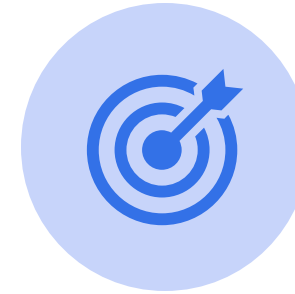
Research & Evaluation