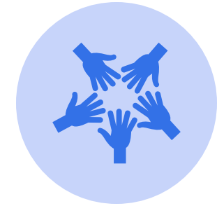
State Data Plan