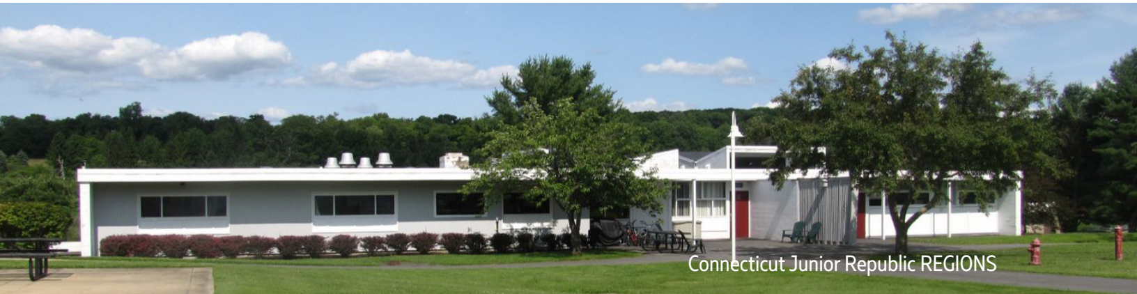
Connecticut Junior Republic REGIONS