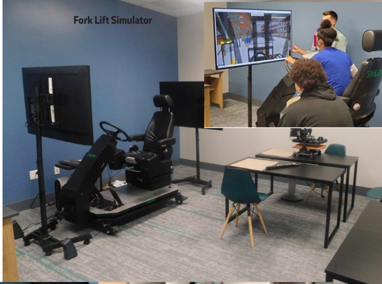
Fork Lift Simulator