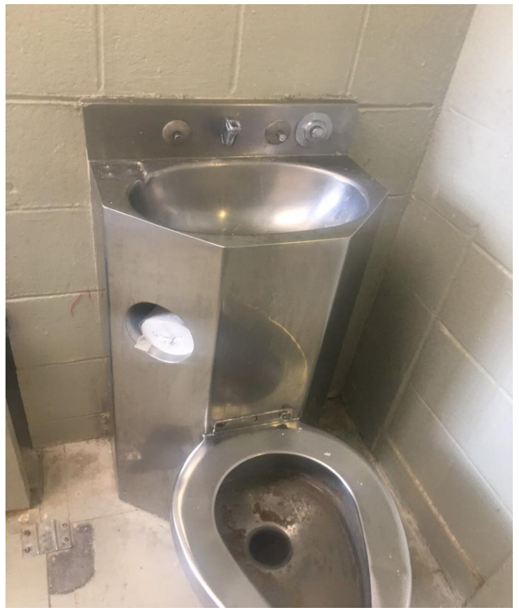
In-cell toilet for a minor boy at MYI