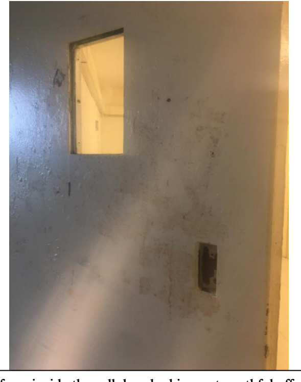
View from inside the cell door looking out youthful offender unit