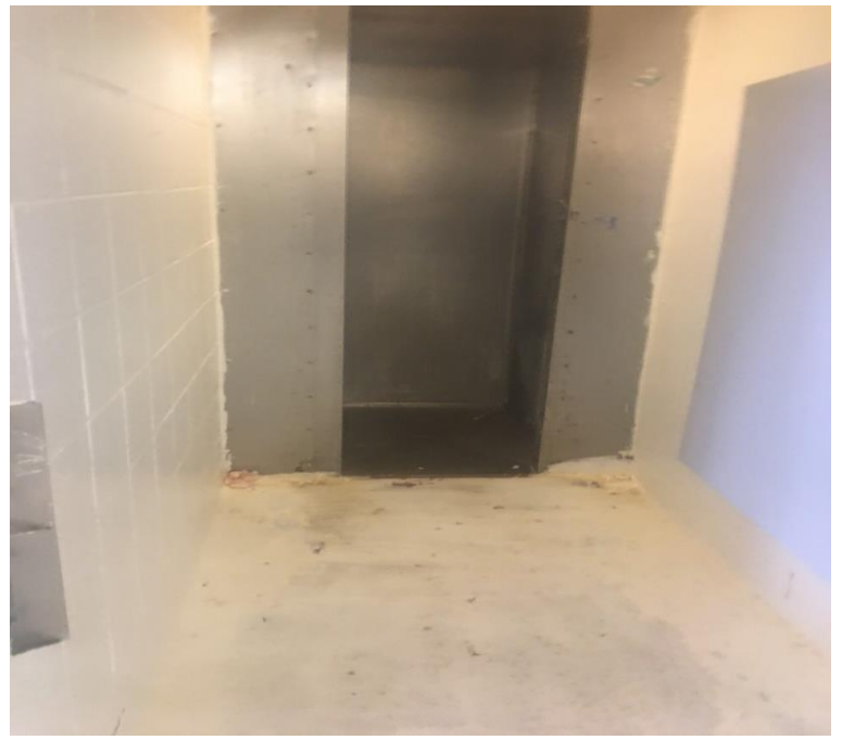
Shower for minor boys at MYI