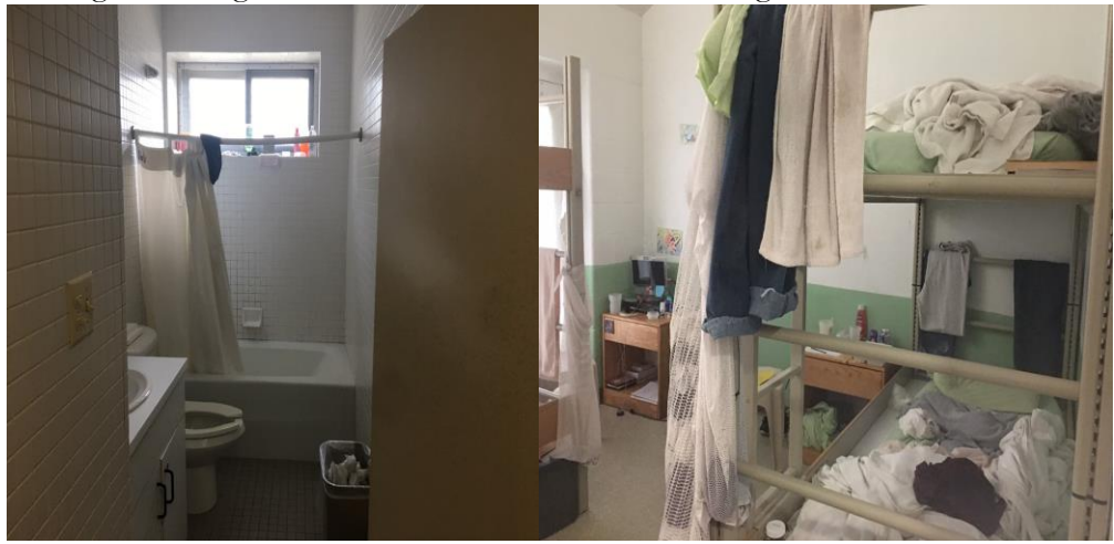
Minor girls' bedroom at YCI.